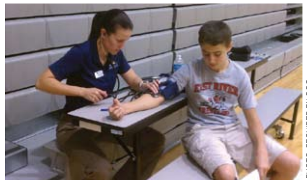
Volunteers from Orlando Orthopaedic Center and several other area organizations provide physicals to more than 2,000 high school athletes across 15 schools annually.